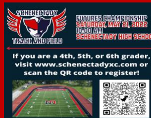
Schenectady Track and Field Futures Championship