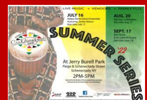
'22 Summer Series at Jerry Burell Park