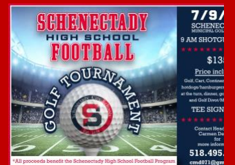
SHS Football Golf Tourney