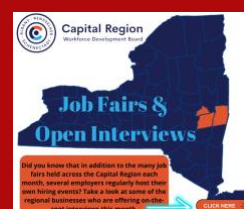
Capital Region Job Fairs & Open Interviews

Be sure to check out student artwork at the Annual Art Exhibit on display at the ViaPort Rotterdam Mall. Students in all grades have work on display. The show is open through May 22.