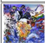
Tahreem Pirzada Grade 9