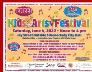
Kids Art Festival