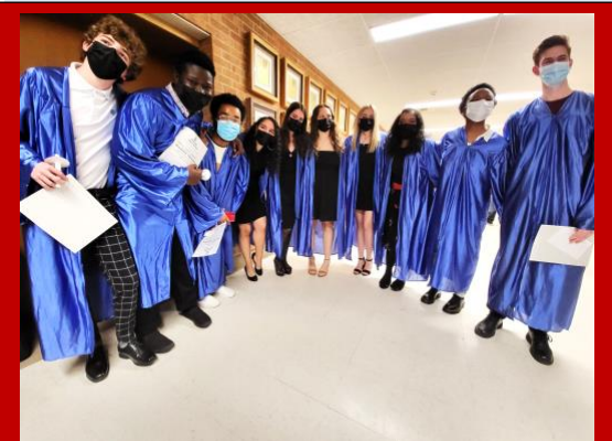
Schenectady High School's National Honor Society Induction Ceremony was held Monday, November 29. Congratulations to these hard-working students for their achievements in academics, leadership, community service and character.