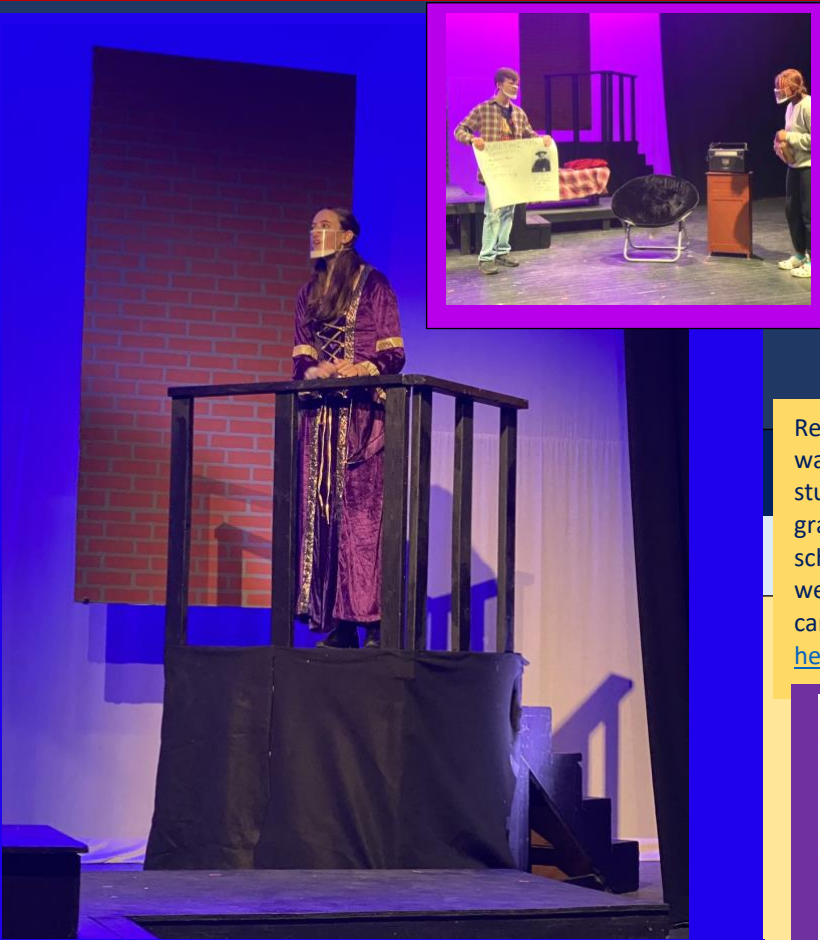
Blue Roses Theatre Company kicked off the annual Fall Showcase on Thursday, November 18. After last year's all virtual performance, the actors, crew, and audience were excited to be in person for this year's show.