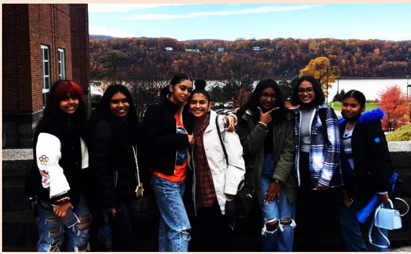
SHS students who are part of the Smart Transfer Early College High School Program at SUNY Schenectady went on a college tour at Marist College earlier this week.