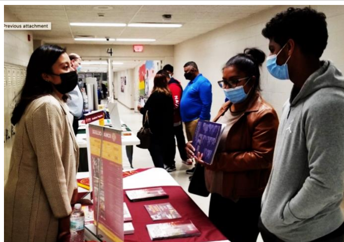
On September 30, the Schenectady High School College Fair included nearly 60 colleges and universities. Hundreds of students attended to ask questions, meet representatives, and plan their future. #SchenectadyRising