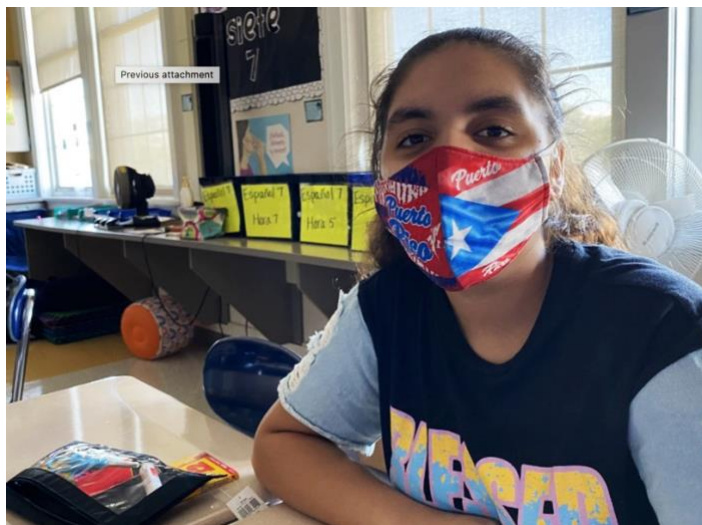
We spotted some students celebrating their heritage in school this week. Follow us on Instagram @SchenectadyCitySchoolDist for more #HispanicHeritageMonth.